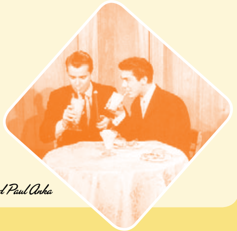
Dick and Paul Anka

Chocolate cookie, strawberry-banana, chocolate banana, vanilla, chocolate or strawberry. 3.59